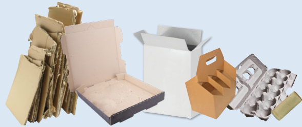
Cardboard & Boxboard (Clean & dry)