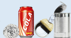
Aluminum & Steel Cans (Foil & empty food & beverage cans)