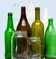
Glass Bottles & Jars (Empty food & beverage bottles & jars)