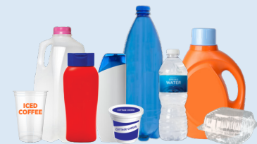
Plastic Bottles, Jugs, Tubs, & Lids (Empty kitchen, laundry, & bath containers & clamshells)