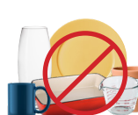
CERAMICS OR BAKING GLASS