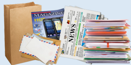
Junk Mail, Periodicals, & Office Paper (Paper bags, envelopes, & catalogs)