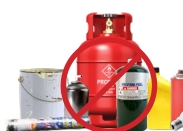
HAZARDOUS MATERIALS OR EXPLOSIVES