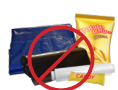
PLASTIC WRAP, FILMS, OR TARPS