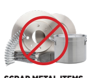
SCRAP METAL ITEMS