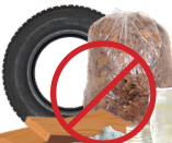
WOOD, WASTE, OR TIRES