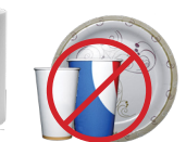
WAXY COATED PAPER ITEMS